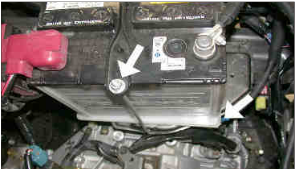
15. Loosen the battery hold down bracket and slide the battery as far towards the fender as possible.