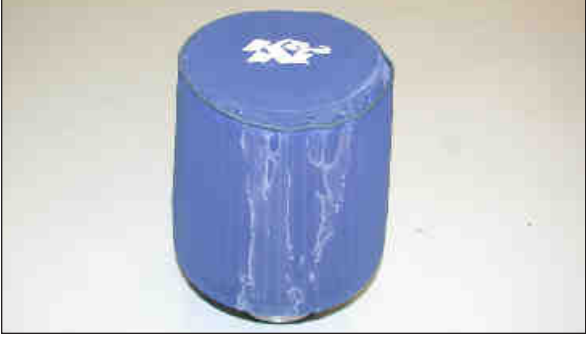
31. Install the Drycharger® onto the K&N® air filter as shown. NOTE: Please be aware the Drycharger® is water repellent, not water proof. Depending on conditions and usage the water repellent treatment is good for 1 to 2 years. See the parts list to reorder a new Drycharger® if necessary.