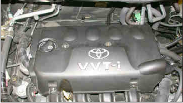
35. Install the engine cover back onto the vehicle.