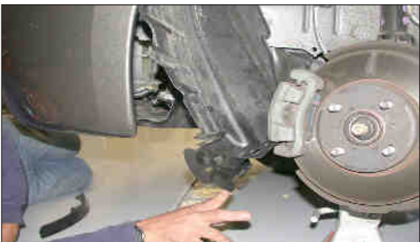
20. Remove the two bolts that secure the inner fender valance, then, lower the valance downward as shown.