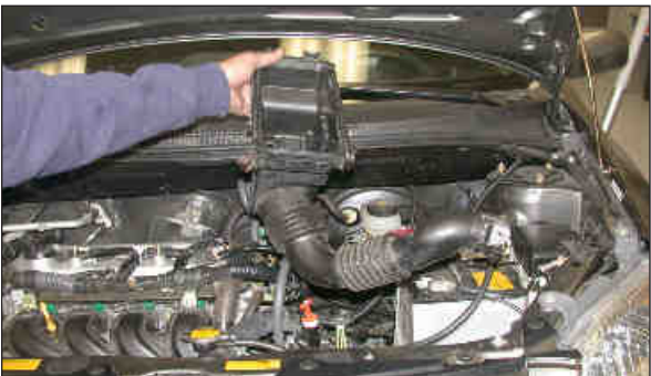
14. Pull upwards to remove the lower air cleaner assembly as shown. NOTE: K&N Engineering, Inc., recommends that customers do not discard factory intake.