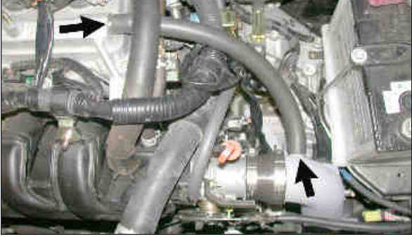
30. Install the provided silicone hose onto the vent on the K&N® intake tube, then, connect the other end to the vent on the cam cover along with the provided hose clamp.