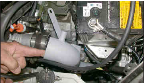
26. Slide the K&N® cold air tube into the engine compartment as shown.