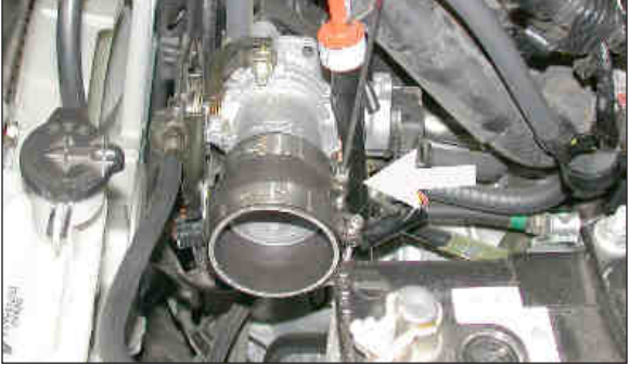
23. Install the silicone step hose and hose clamps onto the throttle body and tighten as shown.