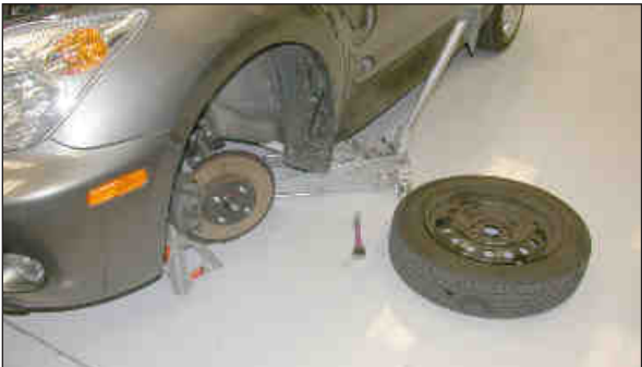
18. Raise the vehicle up and support it with jack stands, then, remove the front driver side tire as shown.