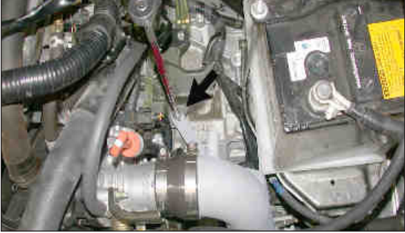
29. Adjust the tube for best fit then tighten the bracket and the hose clamp as shown.