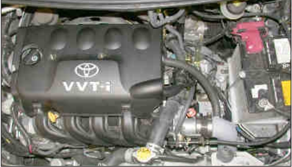
36. Reconnect the vehicle's negative battery cable. Double check to make sure everything is tight and properly positioned before starting the vehicle. WARNING: Please follow these installation instructions carefully. The K&N® high flow intake system is a performance product that can be used safely during mild weather conditions. During harsh and inclement weather conditions, you must return your vehicle to stock OEM air box and intake tract configuration. Failure to follow these instructions will void your warranty.

37. The C.A.R.B. exemption sticker, (attached), must be visible under the hood, so the emissions inspector can see it when the vehicle is required to be tested for emissions. California requires testing every two years, other states may vary. 38. It will be necessary for all K&N® high flow intake systems to be checked periodically for realignment, clearance and tightening of all connections. Failure to follow the above instructions or proper maintenance may void warranty.