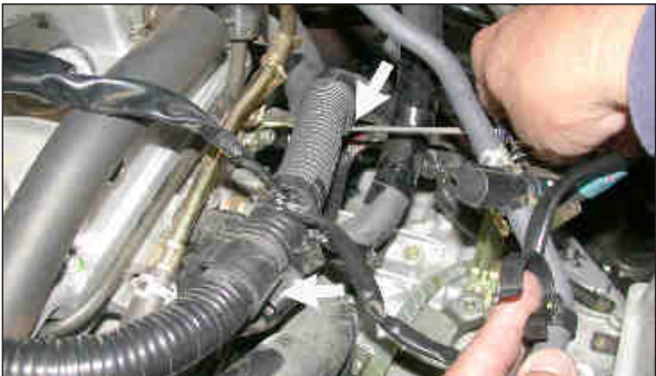
17. Unclip the two plastic wire harness clips to gain more slack for the mass air sensor electrical connection as shown.