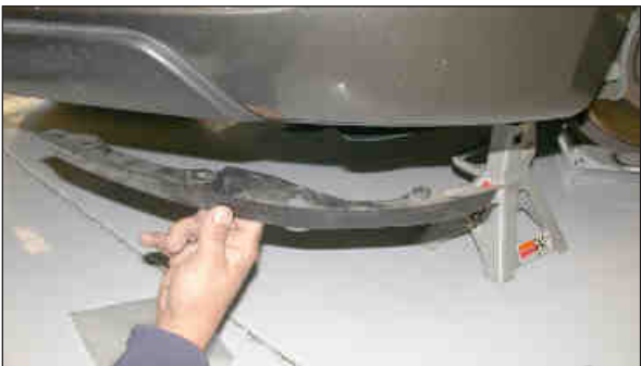
19. Remove the plastic air damn that is secured by three bolts, then remmove as shown.