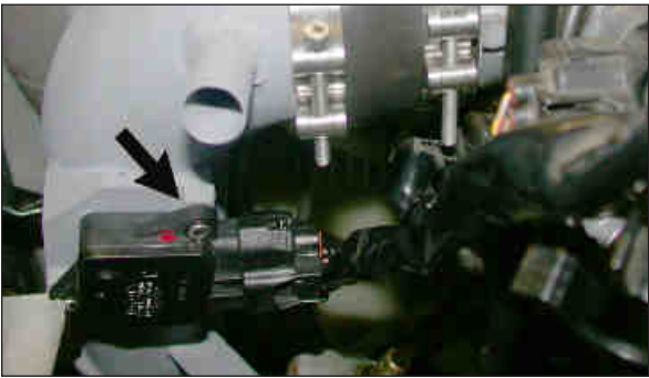
28. Reconnect the mass air sensor electrical connection using the provided hardware as shown.