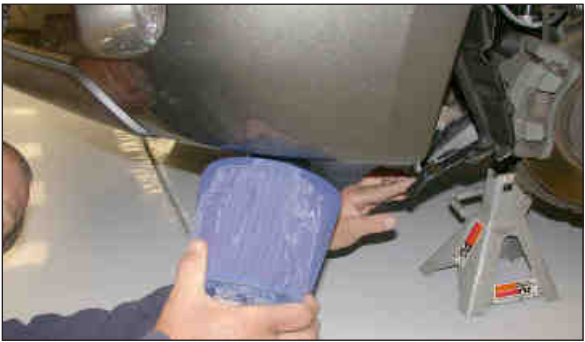
32. From underneath the vehicle pull the inner fender valance down, then, slide the air filter onto the cold air tube and secure with the provided hose clamp.