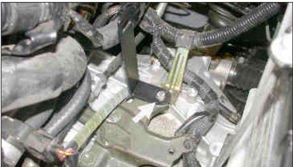
21. Install the provided "L" bracket onto the stock air cleaner mounting hole using the provided hardware as shown.