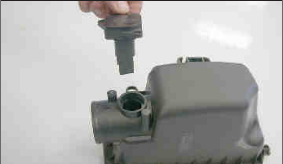
24. Remove the mass air sensor from the upper air cleaner assembly as shown.