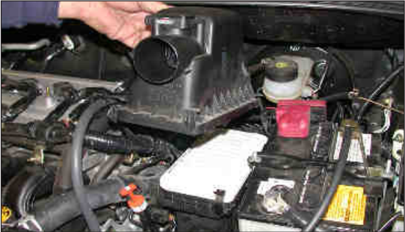
11. Release the clamps on the upper air cleaner assembly, then remove the upper air cleaner assembly as shown.