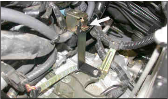
22. Slide the vacuum switching valve onto the "L" bracket as shown. NOTE: On 2007 and later vehicles, use the provided screw, star washer, and flat washer to attach the vacuum switching valve to the bracket.