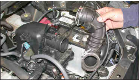
10. Loosen the hose clamps at the throttle body and at the air cleaner assembly, then, remove the stock intake tube as shown.