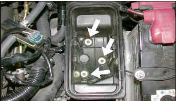
13. Remove the three screws that secure the lower air cleaner assembly as shown.