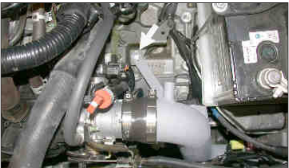
27. Slide the end of the tube into the silicone hose on the throttle body, then secure the bracket to the air cleaner mounting hole using the provided hardware as shown but do not tighten at this time.