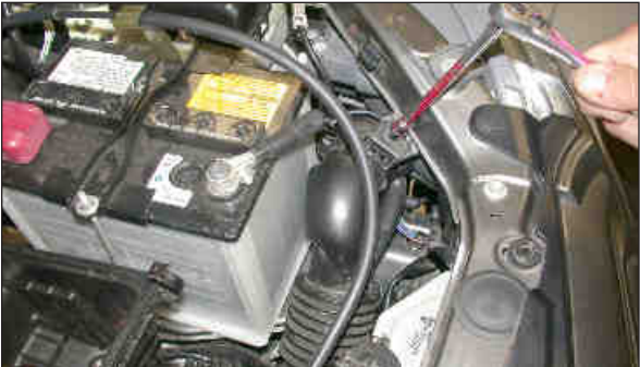
12. Remove the bolt that secures the air inlet duct as shown.