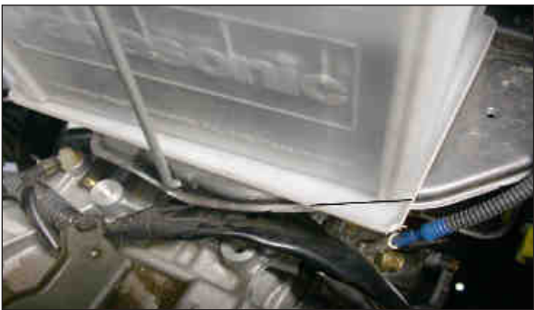
16. Using a cutting tool, trim the plastic battery tray to mirror the inner fender as shown.